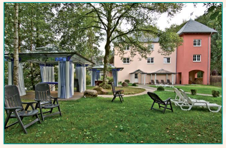
Meadow with Massage Pavillons