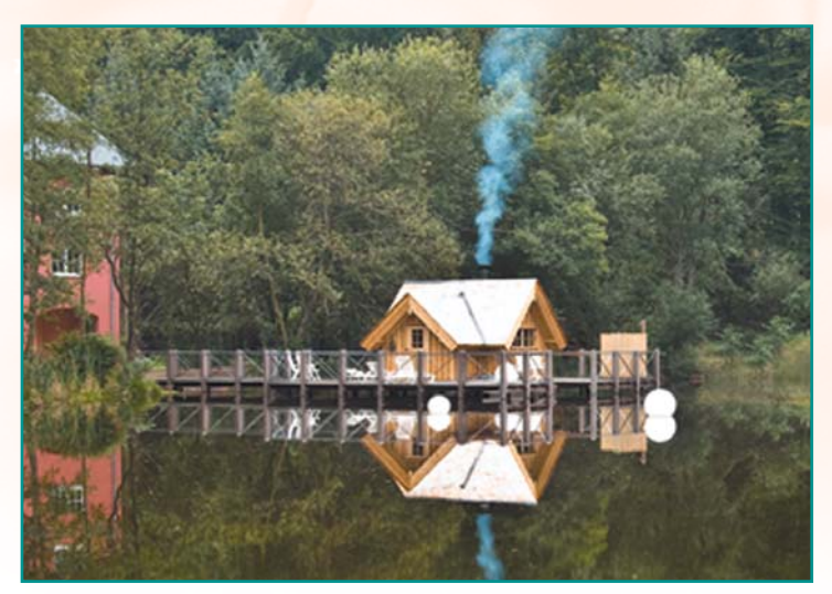
New Sauna on stilts in the bathing lake